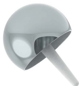
ADEPT ® Resurfacing Head