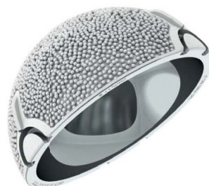
ADEPT ® Metal on Metal Cup